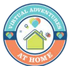
Virtual Adventures at Home